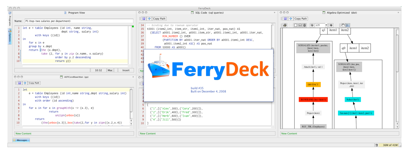
Figure 7: Screen shot of FerryDeck taken while processing P_i . As you type, FerryDeck translates the input program and continuously updates views of the compiled program, plan bundle, emitted SQL code, and result.